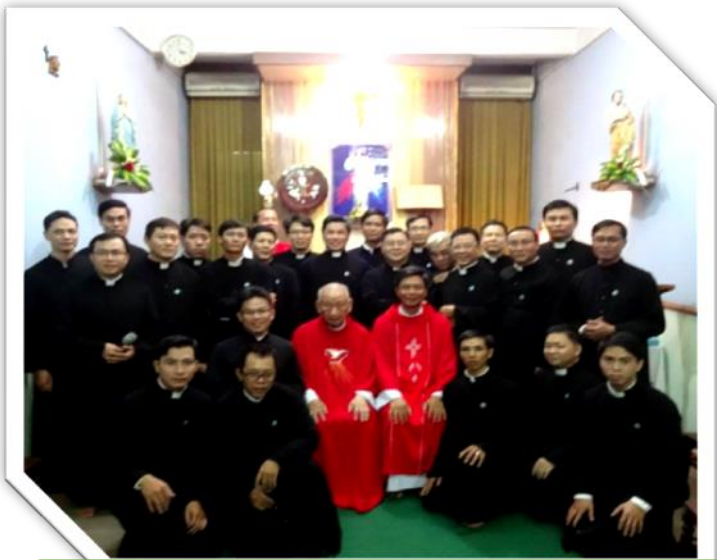
General Superior give religious habit for brothers