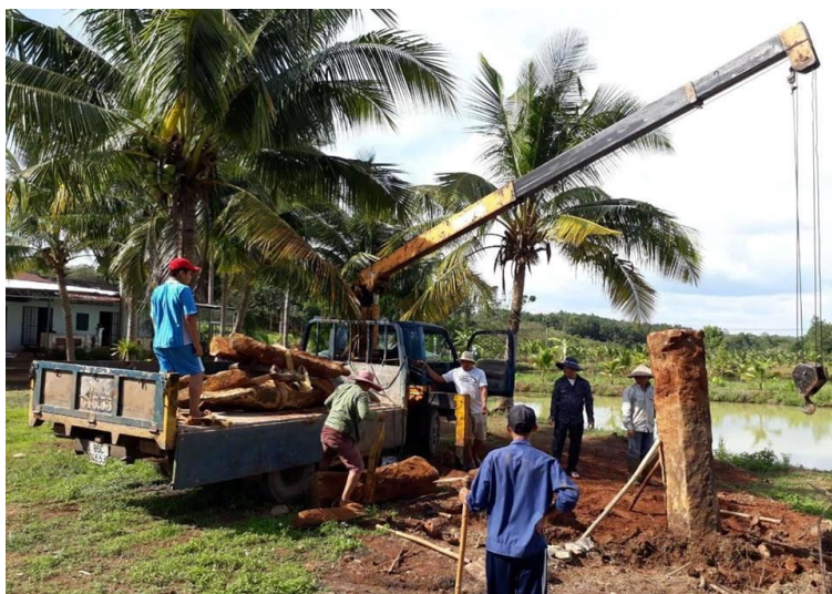
Father General Superior visit communities in Binh Phuoc to promote brother's spiritual life and Society