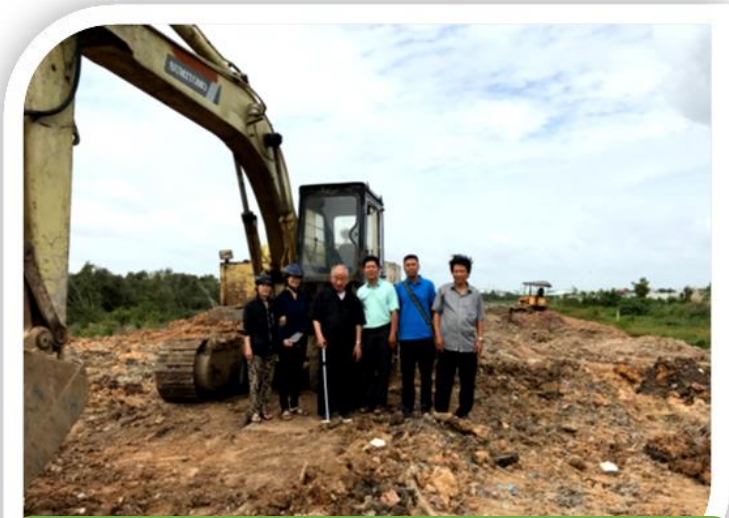
The piece of 5,000m 2 land was filled to built the Mother and Noviciate house at Vinh Loc B