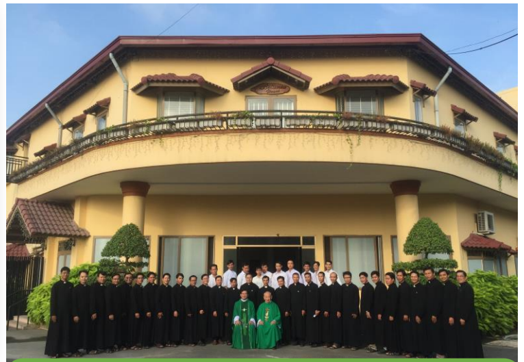
The first retreat time in 2018 at Betania retreat house